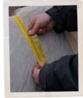
Use a weigh tape to monitor heart girth regularly